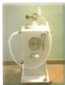
BIO FLUFF mod. HT