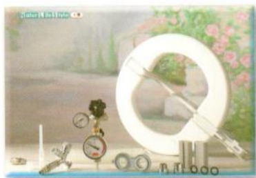
BIO FLUFF mod. NEAT COLON