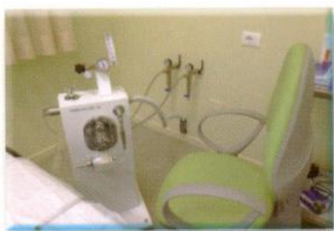
BIO FLUFF mod. HT