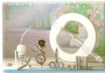
BIO FLUFF mod. SM