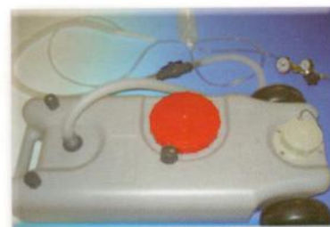
ADAPTER KIT PROFESSIONAL PORTABLE

The medical device BIO FLUFF mod. HT is an equipment made in Italy, compact, safe and very easy to use.